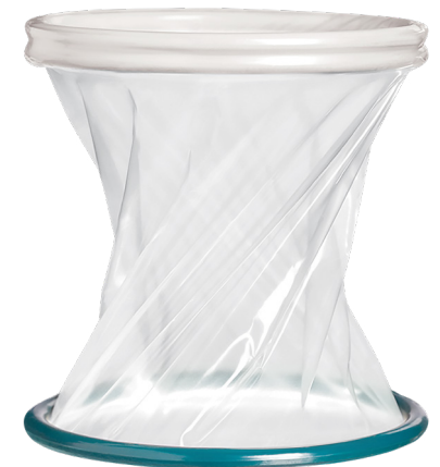
Alexis Wound Protector-Retractor