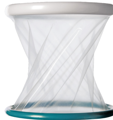
Alexis O Wound Protector-Retractor