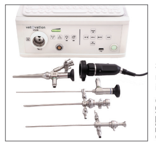
Scan for more information.