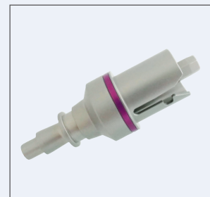
SMALL AO - LOW PROFILE